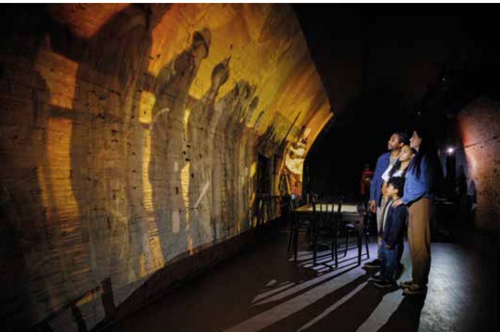
Image The immersive tunnel experience at Dover Castle.

www.groupleisureandtravel.com/awards/vote