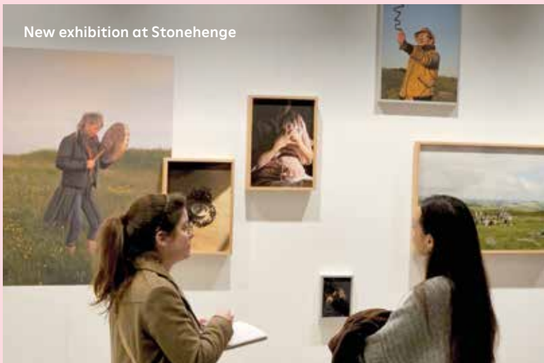
New exhibition at Stonehenge