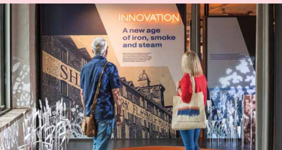
Top image Shrewsbury Flaxmill Maltings Left The exhibition space

You'll find Shrewsbury Flaxmill Maltings on the edge of the town centre. It's open seven days a week from 1 April until 31 October, and at weekends during the winter.