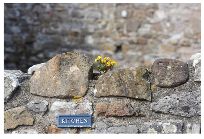
Students could explore the kitchens and think about the sights, smells and sounds that servants might have experienced there.