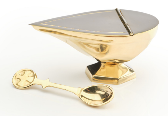
A replica incense boat and spoon.