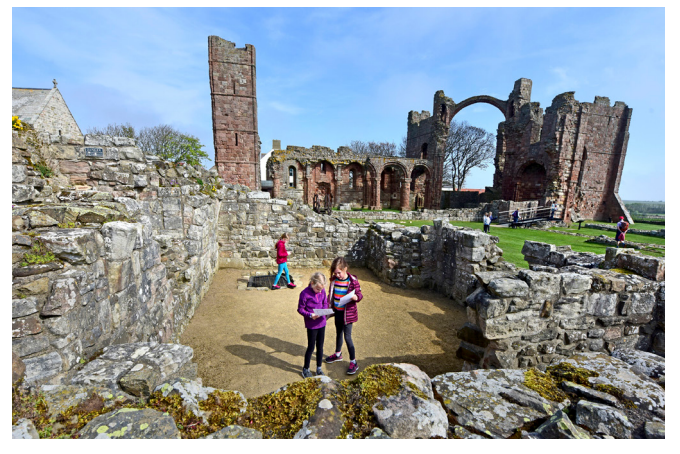
Students could also use the Top Things To See Trail in the Lindisfarne Teachers' Kit to find out more about the architecture.