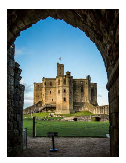
Discover the Great Tower or the bailey using our self-guided interactive explorer trail.