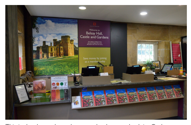
This is the shop, where the group leader can check in. On busy days we also open the admissions point.