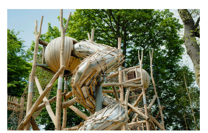
There is a big playground near the castle. This is a safe place for running and climbing.