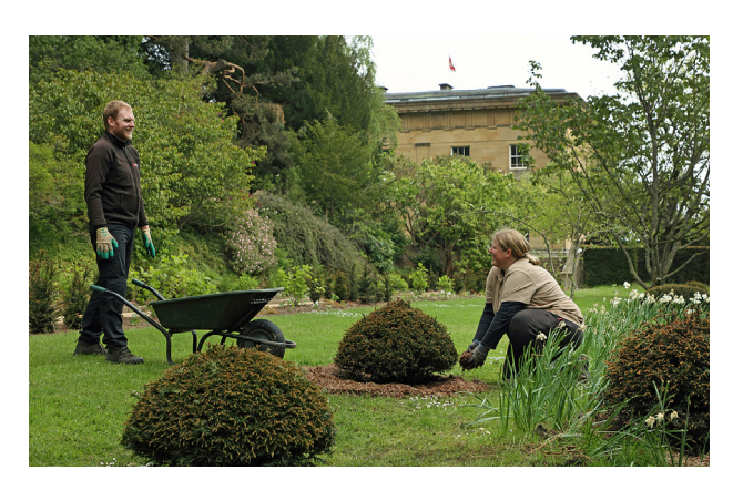
You may see English Heritage staff working in the gardens.