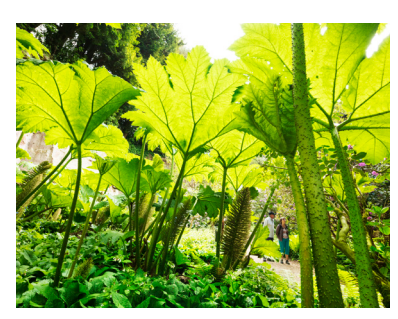
Students can explore the gardens with their senses, like touching the giant leaves of the gunnera in the quarry.