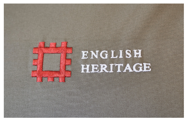
English Heritage staff wear black, white or beige tops with this logo, and they are always happy to help you.