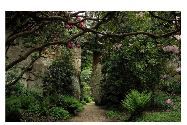
There is a garden in a quarry. It is shady, has high walls, unusual plants, and sometimes feels cooler than the rest of the garden.