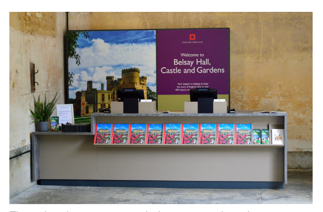
This is the admissions point, which we open on busy days.