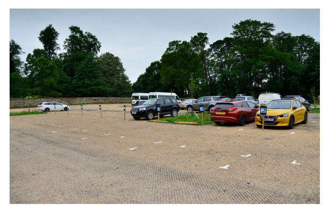
This is where cars and coaches park.