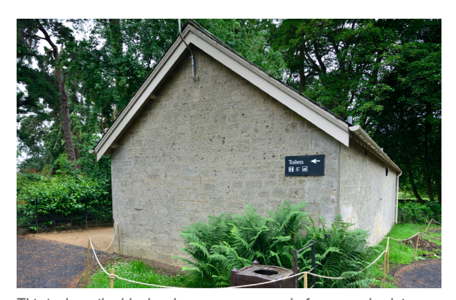
This is the toilet block, where you can stop before you check in.