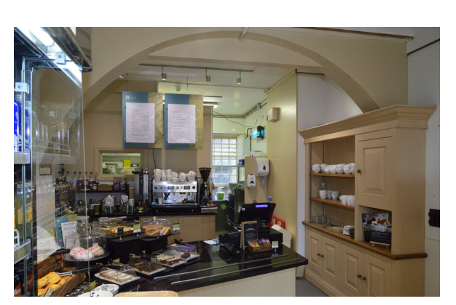
There are two cafes at Belsay, one near the hall and one near the castle. These can get noisy when it's busy.