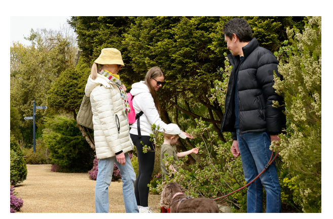
You may see other visitors and their dogs on the day of your trip.