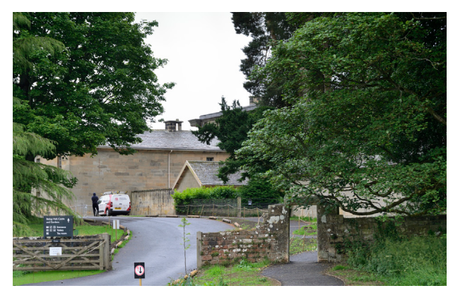
This is the route from the car park to the toilets.