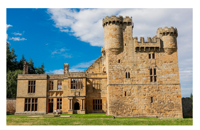
There is a ruined castle. There are different sized rooms and staircases inside.