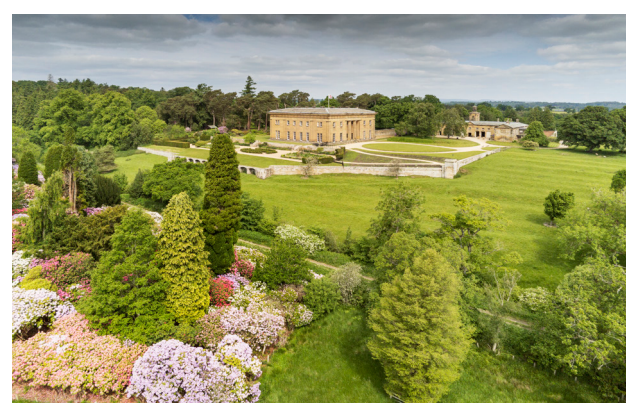
There are some wide open, green spaces.