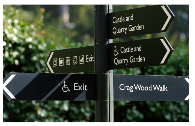
Signs like these will help you find your way around the site.