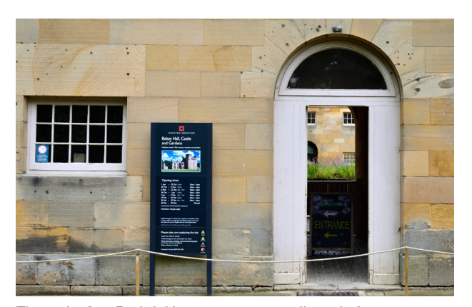
This is the first English Heritage sign you will see, before you enter the shop.