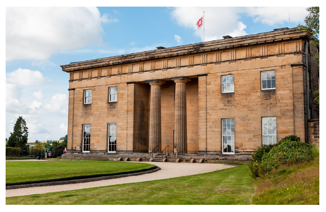
There is a big hall that used to be a family home. The rooms inside don't have furniture in them anymore.