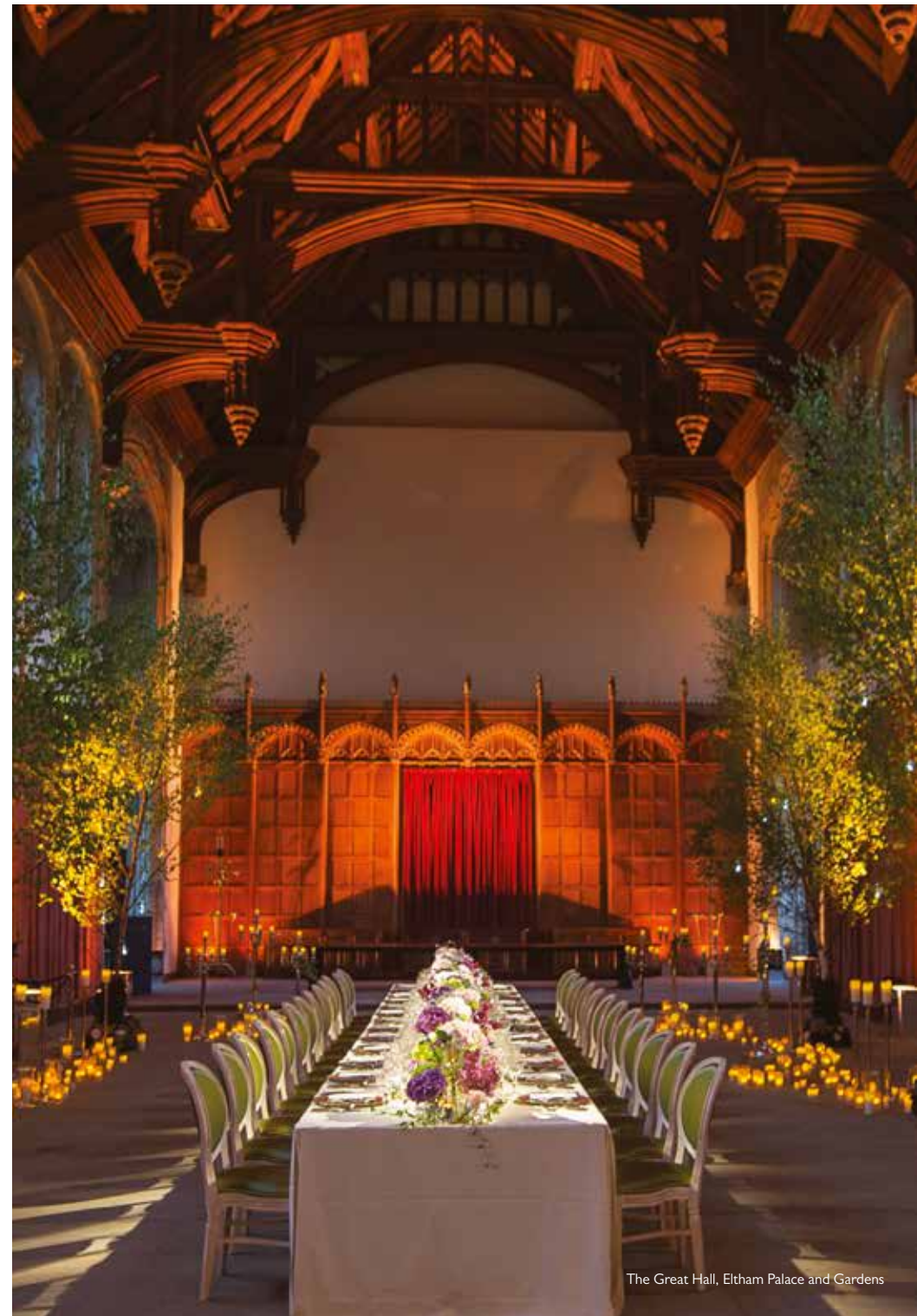
The Great Hall, Eltham Palace and Gardens