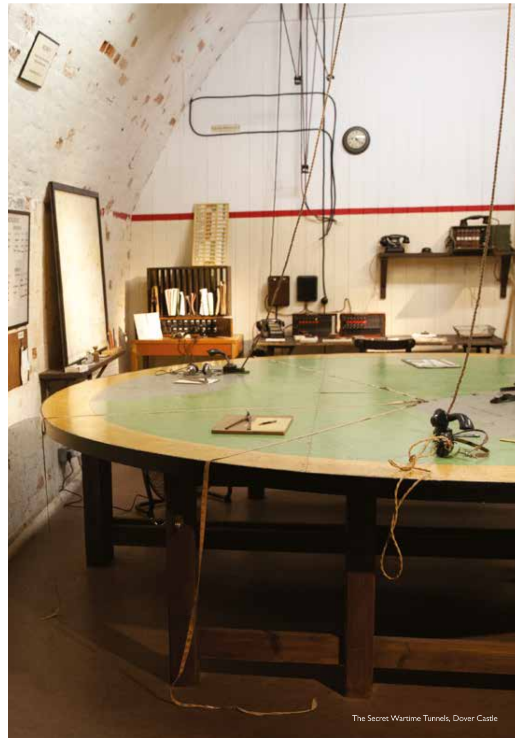
The Secret Wartime Tunnels, Dover Castle