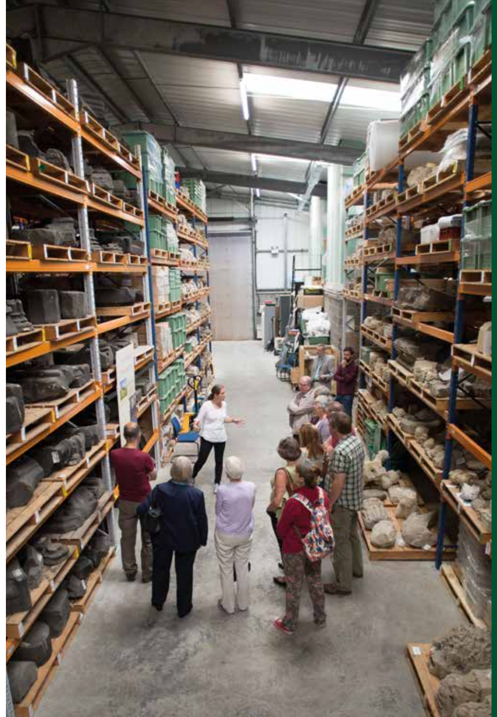
Helmsley Castle Archaeological Store, North Yorkshire