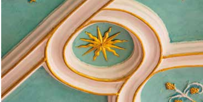
Bolsover Castle, Derbyshire