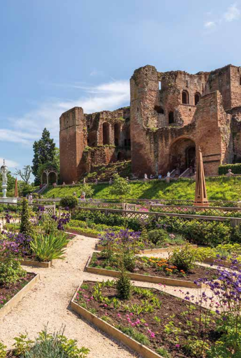
Kenilworth Castle and Elizabethan Garden, Warwickshire