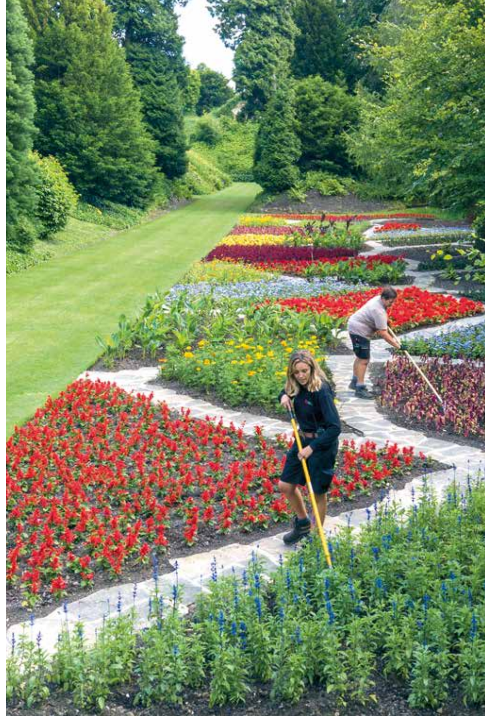
Brodsworth Hall and Gardens, South Yorkshire

American taxpayers can make donations through The American Friends of English Heritage, an independent 501(c) (3) organisation established to support the work of the English Heritage Trust. Donations made to the Friends are deductible for US tax purposes as permitted by law. The subscription fee must be paid to English Heritage.