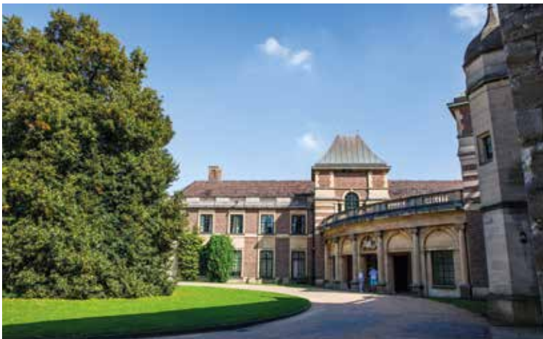
Eltham Palace and Gardens, London