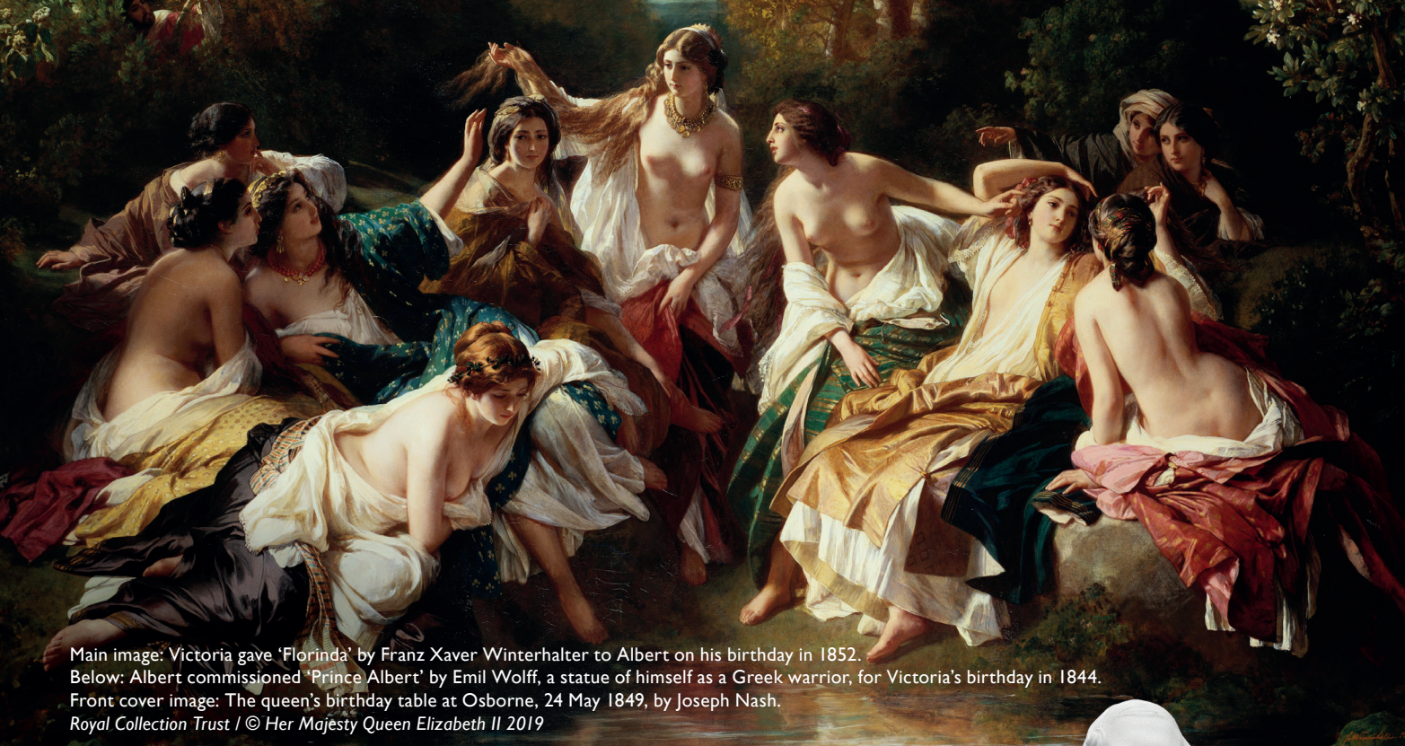
Main image: Victoria gave 'Florinda' by Franz Xaver Winterhalter to Albert on his birthday in 1852.