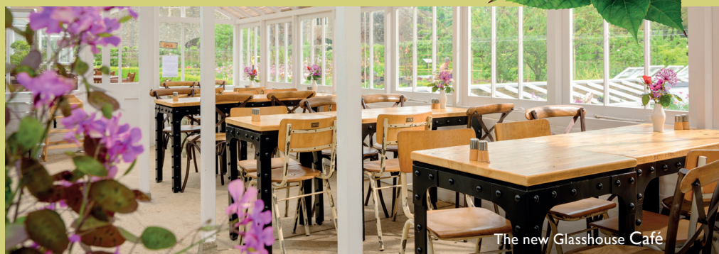
The new Glasshouse Café