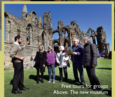
Free tours for groups Above: The new museum

You will also find other new facilities like a coffee shop and a revamped visitor centre with a bigger and better gift shop. The courtyard now provides a warmer, more accessible welcome, with new trees, seating and green spaces planted with herbs.