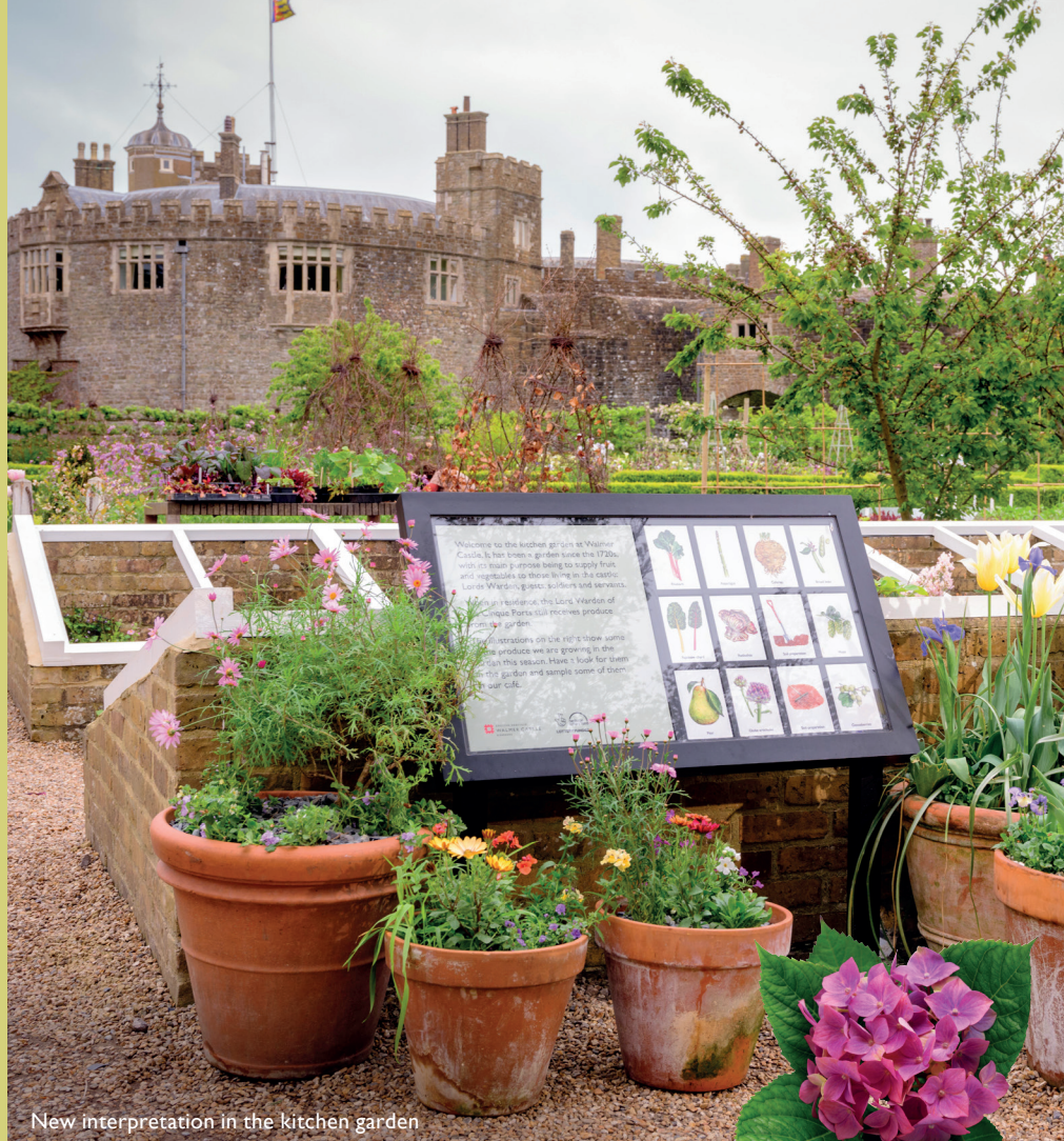
New interpretation in the kitchen garden

Walmer Castle and Gardens Kingsdown Road, Deal, Kent CT14 7LJ Tel: + 44 (0)1304 364288 Email: walmycastlegroupbookings@english-heritage.org.uk www.english-heritage.org.uk/walmycastle