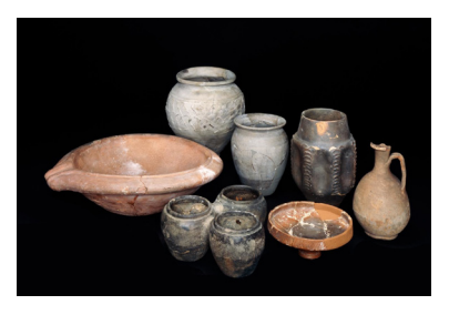
Students will discover what this pottery was used for and where it came from, as well as other details about daily life in Roman Aldborough.