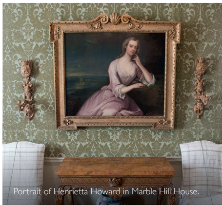
Portrait of Henrietta Howard in Marble Hill House.