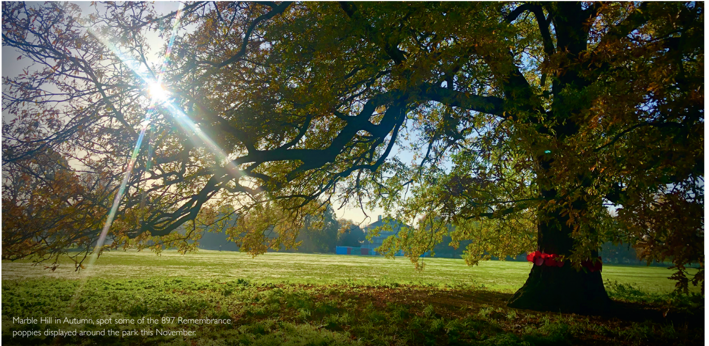
Marble Hill in Autumn, spot some of the 897 Remembrance poppies displayed around the park this November.