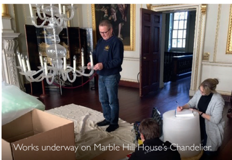
Works underway on Marble Hill House's Chandelier.

As you may have seen, work continues across the park, including archeology in three locations to explore and understand the park's history in a little more detail. More sports pitches have been resurfaced and the children's play area is due to have equipment installed - ready to open alongside the café in 2021. With extra outdoor seating, we hope that the café will be a lovely space to enjoy a hot drink and a bite to eat – and a fantastic way to support the house and park.