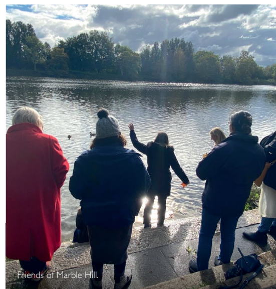
Friends of Marble Hill.

English Heritage cares for over 400 historic monuments, buildings and places. Through these, we bring the story of England to life for over 10 million visitors each year.