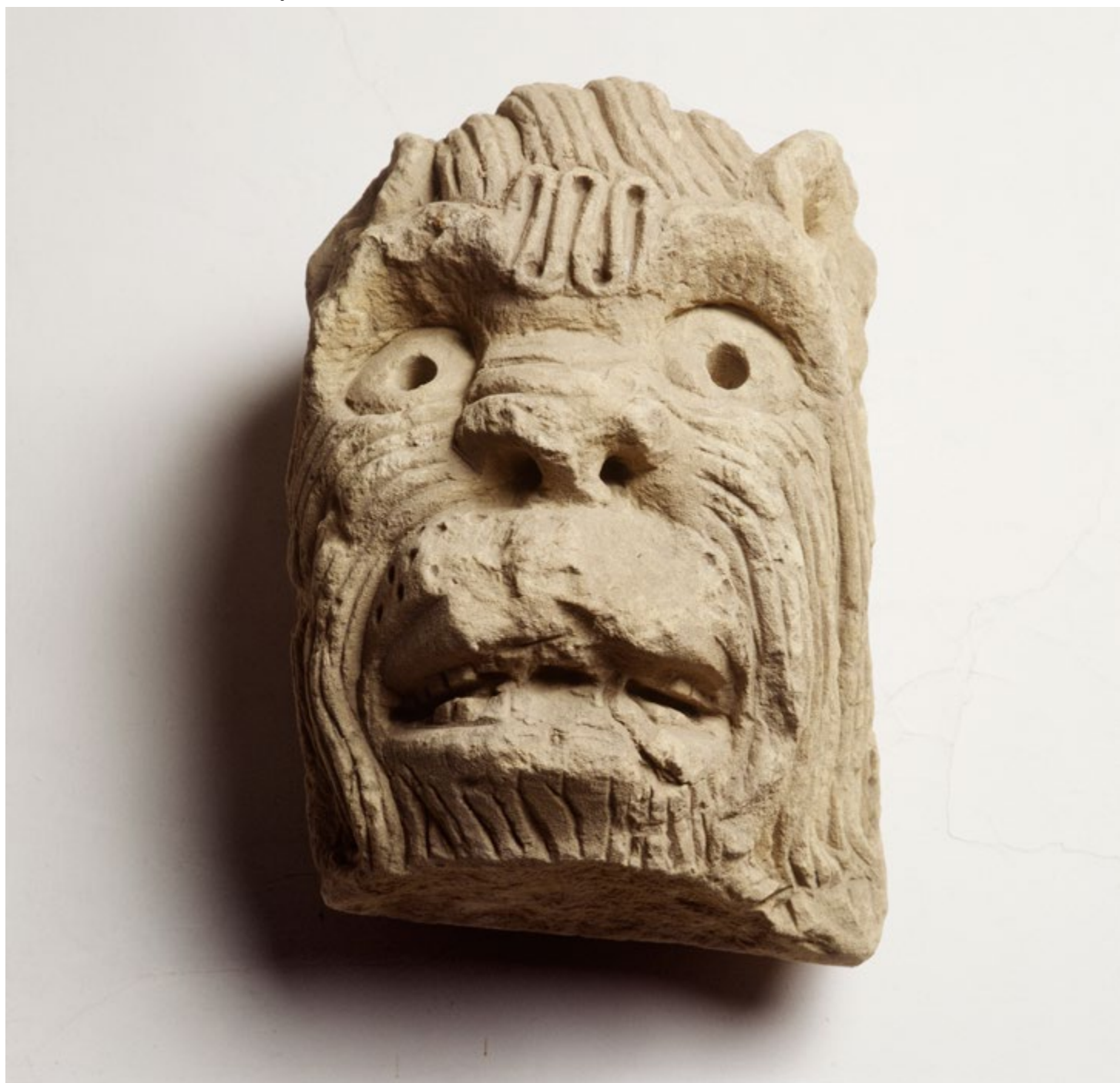
Carved head from abbey.