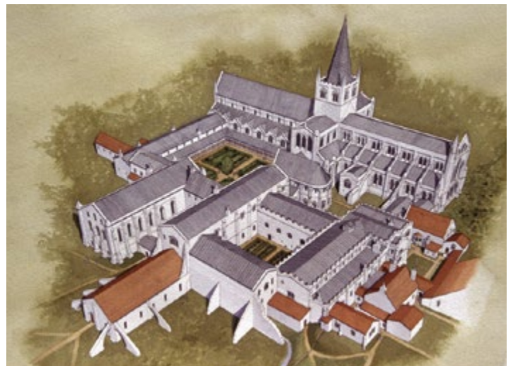
Rievaulx in the 16th century.