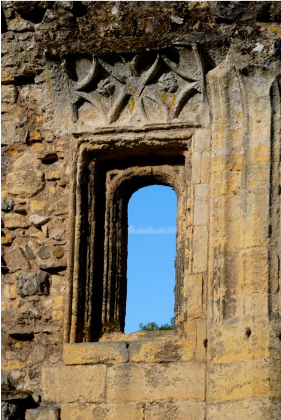
Detail of carved stone window.