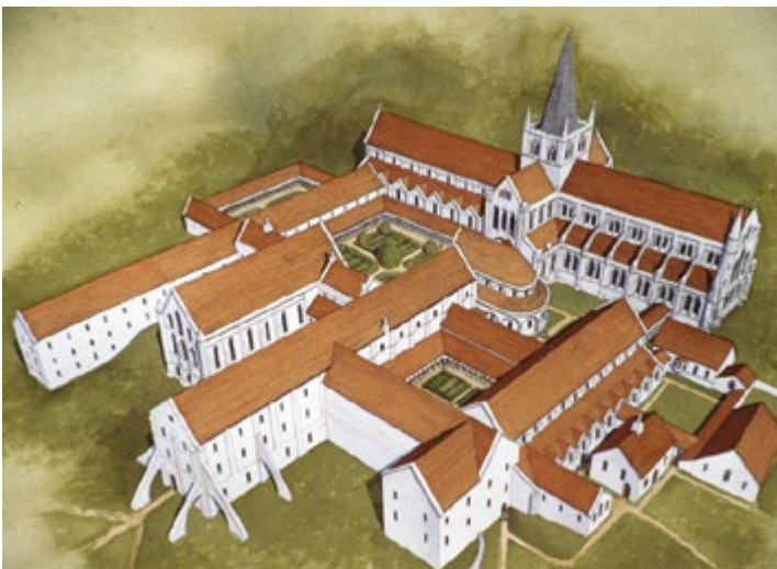
Rievaulx in the 13th century.