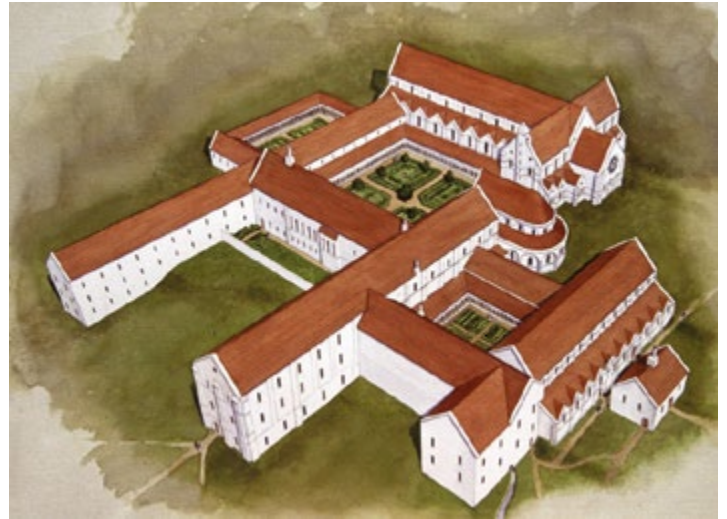
Rievaulx in the 12th century.